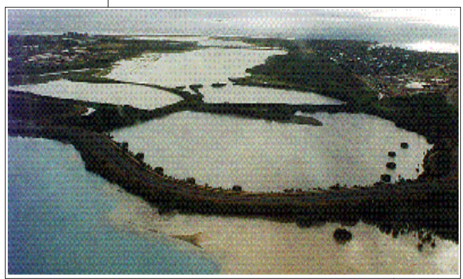
Aerial view of Nu'upia Ponds located within Marine Corps Base Hawaii on the windward side of Oahu.