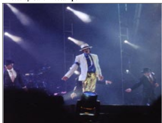
Costume changes ruled the evening as Jackson followed one surprise with another.

further back than they thought they should be, but concern turned to relief as they enjoyed an unblocked view of a stage that measured 225 feet in width, was 125 feet deep, and was flanked by two enormous video screens.